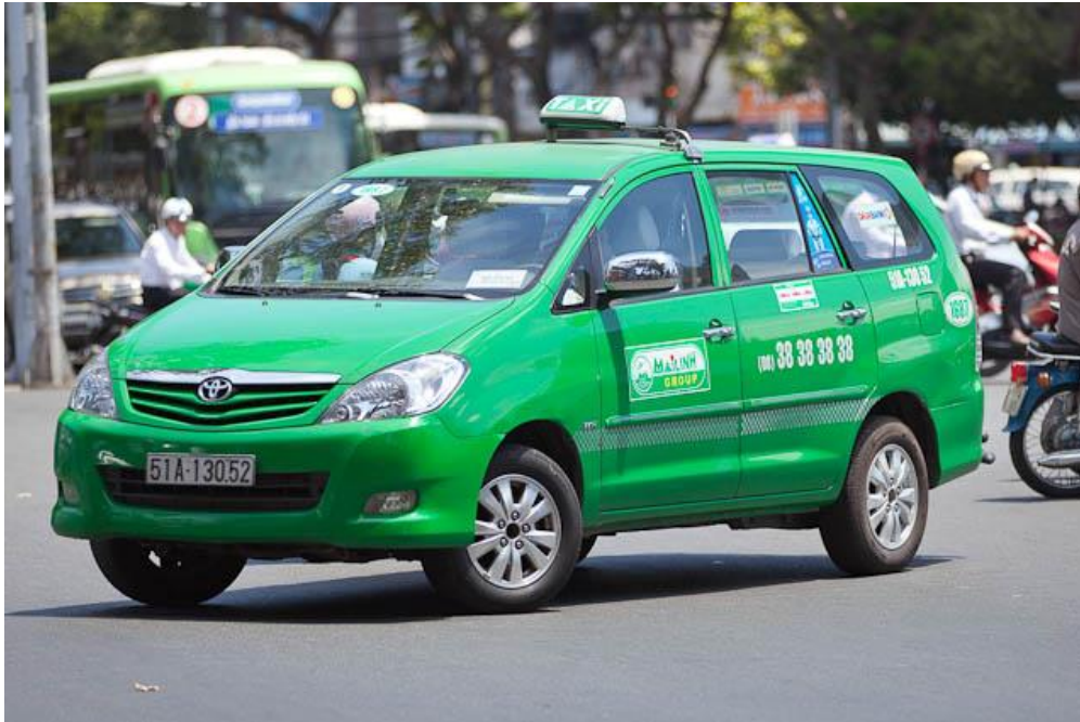
Mai Linh Taxi: 0438 222 666

There are two kinds of taxi: 4-seater and 7-seater. The price for the latter is slightly higher. It's also convenient that Taxi Group and Mai Linh Taxi also accept credit card.