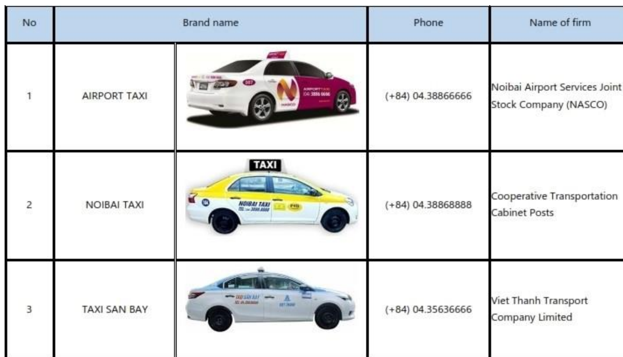
Popular taxi services